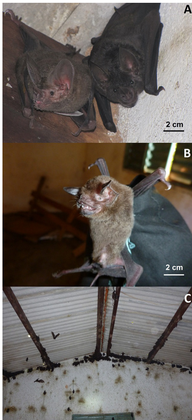
Figure 2. A: Trachops cirrhosus (left) and P. hastatus (right) sharing a roost in physical contact in an abandoned man-made construction between Porto Alegre do Norte and Confresa municipalities, central Brazil; B: Pteronotus parnellii roosting at the same roost where T. cirrhosus and P. hastatus were observed previously; C: an overview of the P. parnellii colony inside the room. This figure is in color in the electronic version.

1982), since both species are from Phyllostominae sub-family and closely related to each other both in terms of their evolution and ecology, or due to the habitat changes in this landscape,